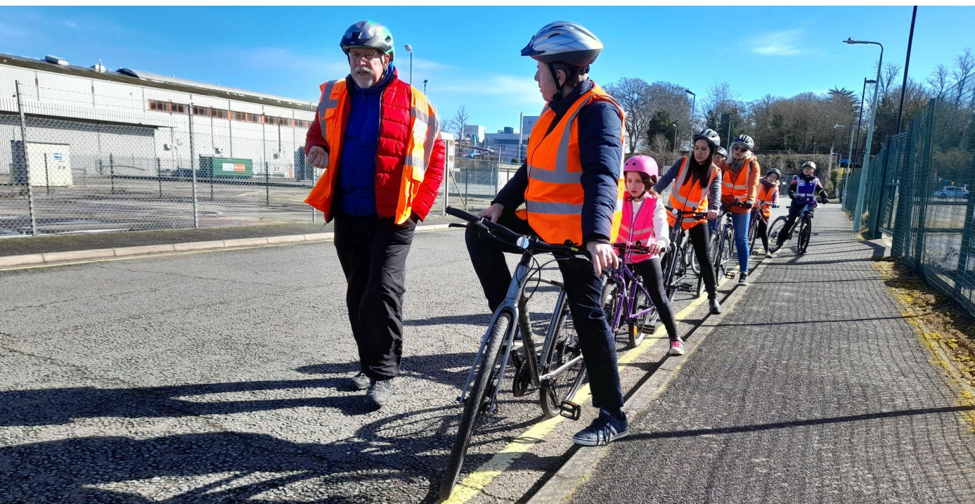
EcoCarriers BSE pushing pedals for a cleaner, greener town 01284 413441 ecocarriersbse.co.uk